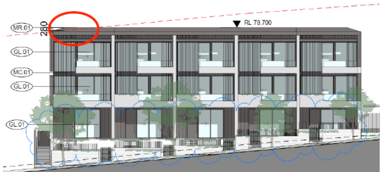
Figure 2 – Proposed south elevation (Block E)