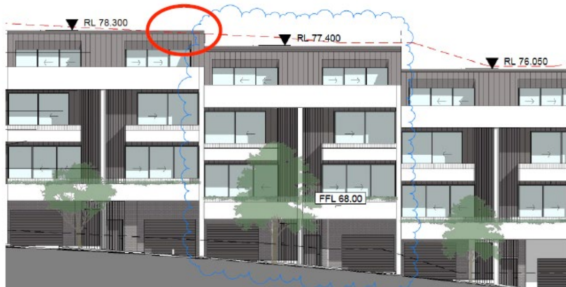
Figure 4 – Proposed west elevation (Block A)

The following figures identify the parts of the building envelope that exceed the 12 m height limit.